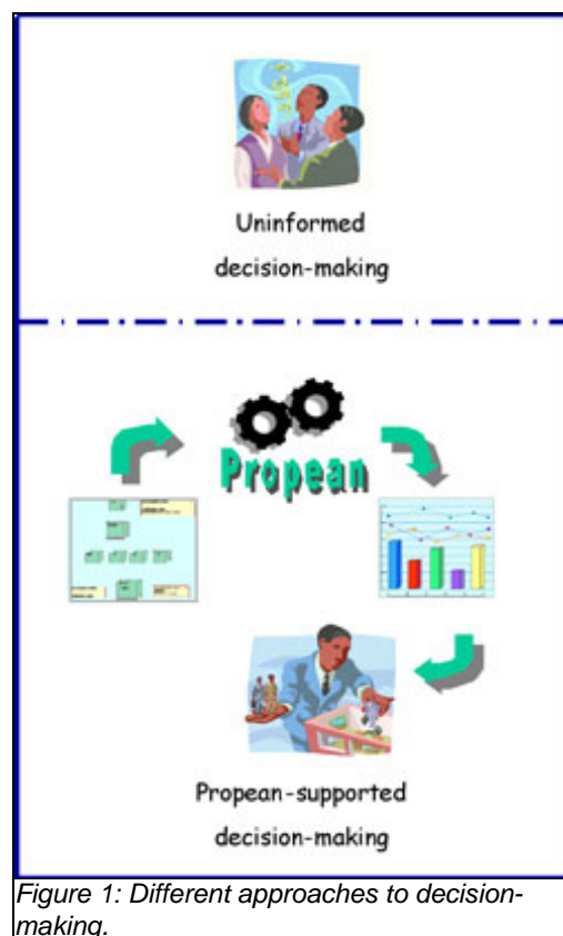
Figure 1: Different approaches to decision-making.

The Propean technology is based on the Software Performance Engineering (SPE) approach, which is a systematic, quantitative approach to software system construction in order to meet performance objectives. Its basic concept is the separation of the Software Model (SM) from its environment or Machinery Model (MM).